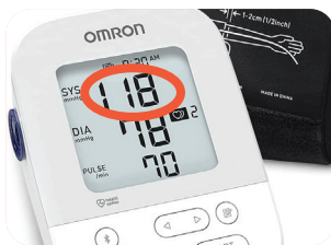
Systolic BP Top number