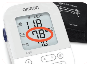
Diastolic BP Bottom number