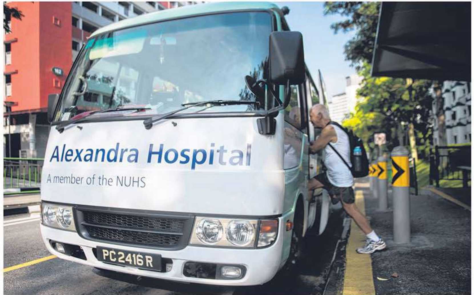
An elderly man boards the new shuttle bus service to Alexandra Hospital by SMRT's Strides. The free buses ply two routes covering areas such as Mei Ling Street and Commonwealth Drive, saving residents from having to go to a nearby MRT station, the usual location for shuttle buses to hospitals.

According to the hospital, plans are now under way for a similar ser-